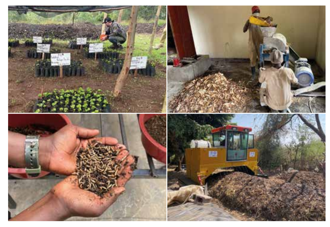
Examples of the RUNRES innovation technologies deployed in phase 1: co- and composting used for coffee plantlets (top left), cassava peels transformed into animal feed supplement (top right), black soldier flies' larvae (bottom left) and mechanised windrow composting (bottom right).

The RUNRES project - in full, The Rural-Urban Nexus: Establishing a Nutrient Loop to Improve City Region Food System Resilience - aims to set a key step in the transformation towards a circular and more sustainable agriculture and waste management in four city regions of sub-Saharan African countries: DR Congo, Ethiopia, Rwanda and South Africa. It is funded by the Swiss Agency for Development and Cooperation (SDC) and entails two main phases: a piloting phase (2019-23) and a scaling-up phase (2023-27). The aim of the first phase was to pilot a set of innovations and evaluate their ability to contribute to a circular economy by linking organic waste management to agriculture. For this, we took a transdisciplinary research approach, where we co-produced the different innovations with different actors: waste collectors, farmers' cooperatives, collection and treatment companies, and regulators. This approach made it possible to co-develop innovations between