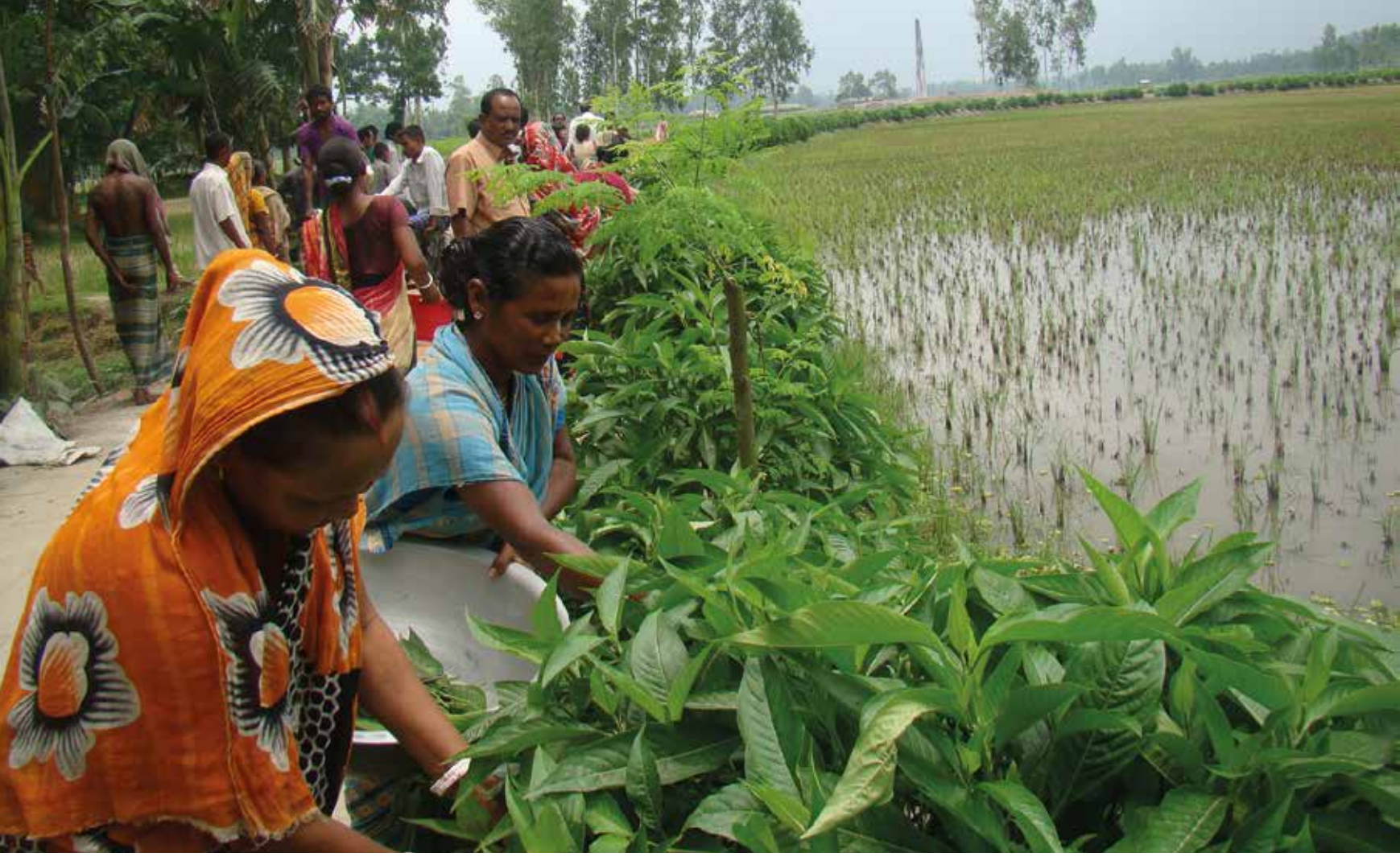
Women harvesting leaves from their bashok crop, which grows along the village lane in the Rangpur district in Bangladesh.