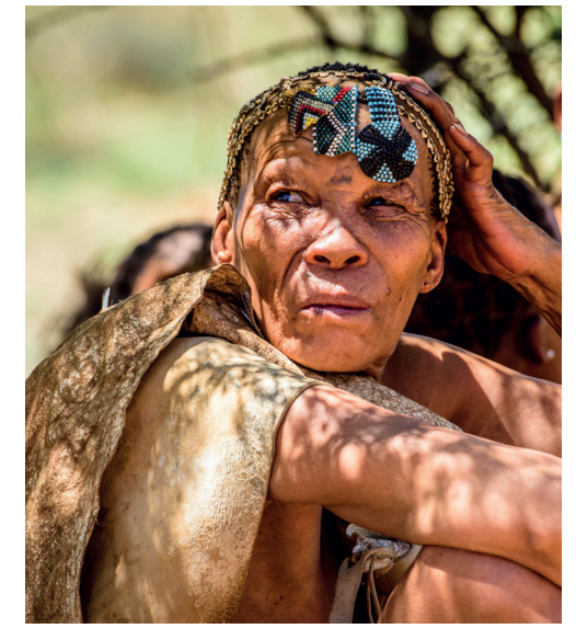
A Bushman woman from South Africa.