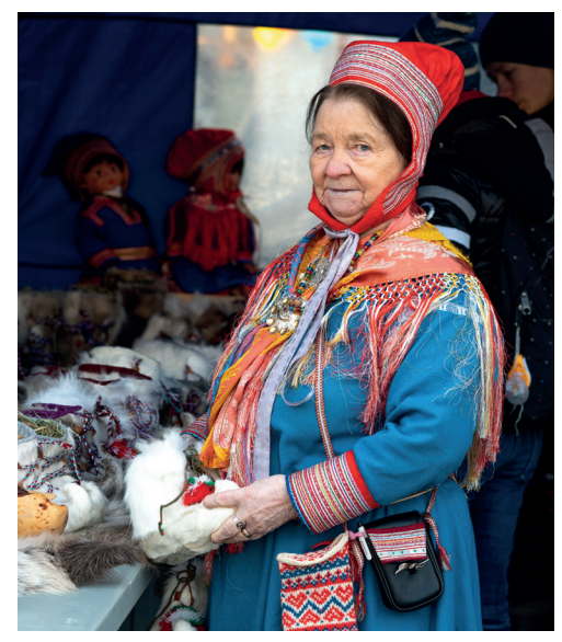
A Saami woman from Norway.