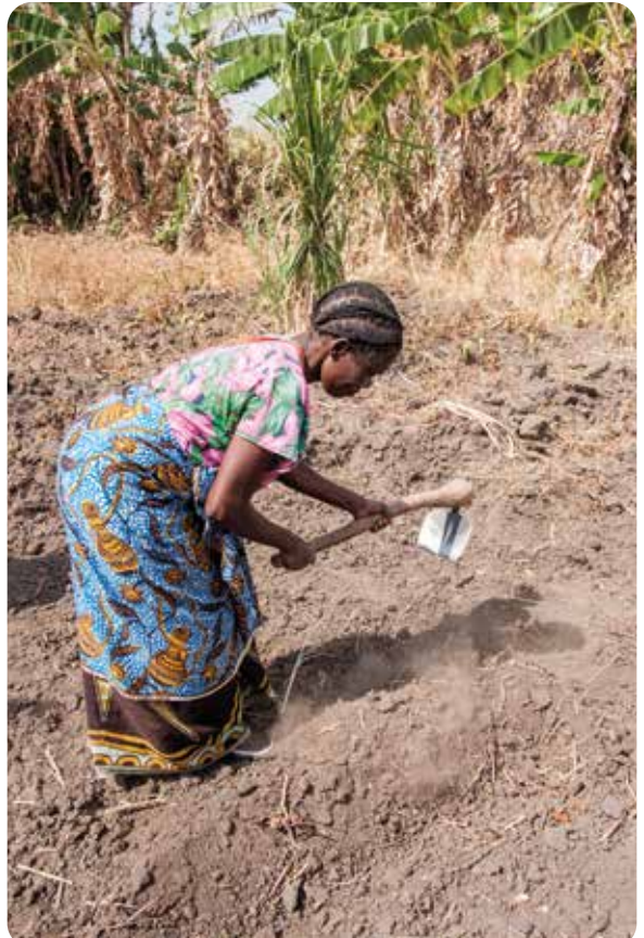
The heavy toil of farming has been a driving force behind humankind's relentless strive to develop smart technologies.

Intensification makes it possible to produce more food on existing farmland, thus preserving land for natural habitats, as long as rebound effects can be curtailed. India is a success story. FAO data shows that it tripled cereal production in the last decades as part of the "Green Revolution" – without significantly expanding farmland. In Africa, the potential for intensification is still large – studies show