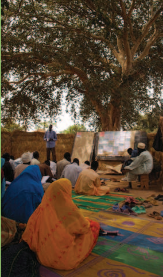
Participatory planning process in rural Chad

In Europe and other OECD member states, different forms of local spatial development initiatives have emerged in recent years. Some of them are based on EU funding programmes, others on national funding programmes. It is the bottom-up approaches, such as the EU's LEADER programme, that have proved to be appropriate instruments for implementing locally agreed development measures. The conceptual added value of these approaches is found in their efforts to use participatory ways of identifying local solutions for local problems. LEADER uses a 'territorially based' approach as a way of creating activities and jobs in rural areas that involves local people and focuses on enhancing the value of local resources. This methodology aims to specify how to proceed, rather than what needs to be done. Initially funded and implemented in EU Member States only, for a number of years now it has increasingly cooperated with non-EU countries that - although they are not actually directly within the programme area - follow guidelines similar to those of the LEADER programme (e.g. South-East Europe, Azerbaijan, Georgia, Brazil, Tunisia and Algeria).