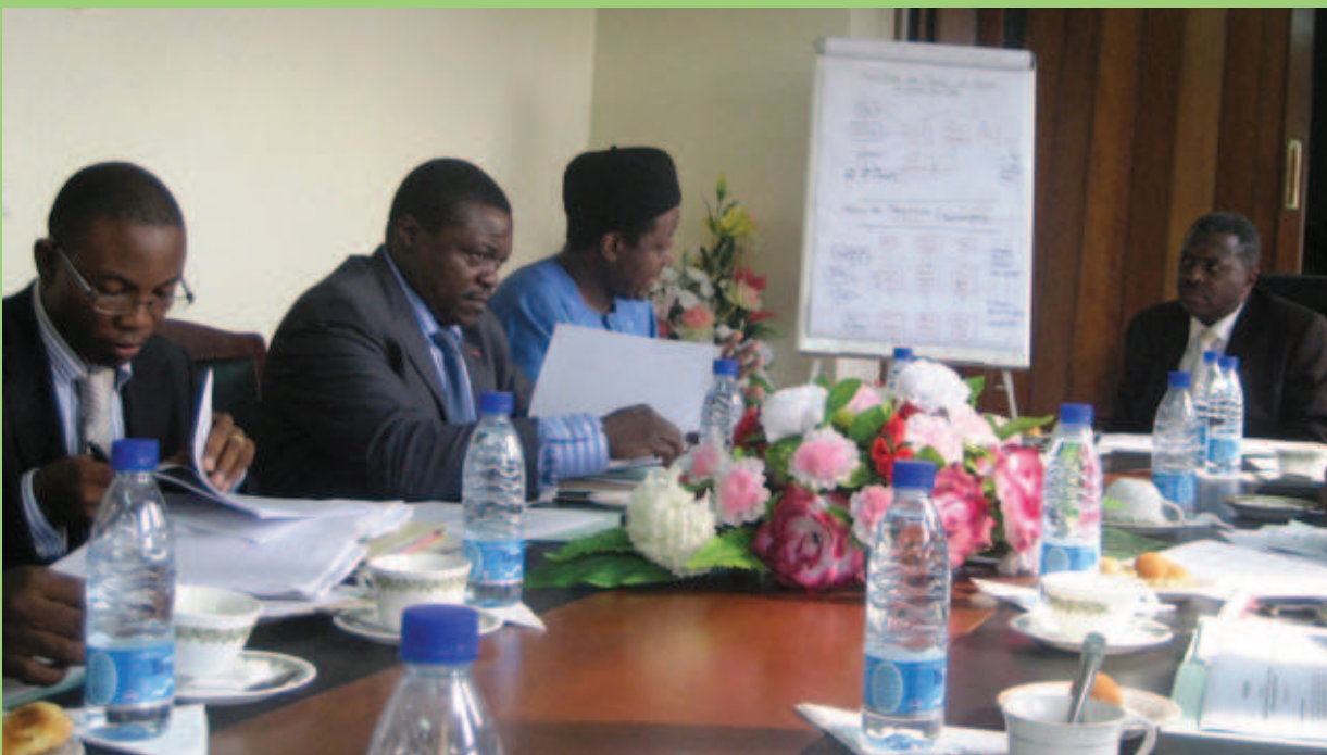
Administrative meeting in Cameroon

Individual organisations and institutions in rural areas are often still not adequately networked with each other. Municipalities carry out their development initiatives without consultation with neighbouring municipalities and they do not cooperate to any great degree with the private sector or civil society organisations. Public servants working in dispersed government agencies either do not treat municipalities as their equals, or allow themselves to be guided by economic self-interest. Mayors and municipal councillors do not consult with traditional authorities. Clarifying relationships and establishing both horizontal and vertical communication and networking is an important element in nurturing a region's potential and achieving autonomous development.