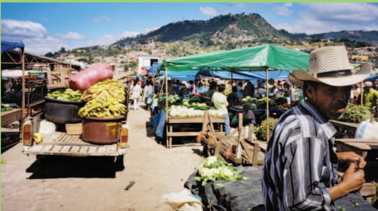
A local market in a rural region in Honduras

The contribution made by development cooperation starts with building the institutional, financial, technical and human capacities needed. Development cooperation can identify innovation potential, deliver technical inputs and act as a facilitator in devising and implementing an appropriate legal and policy environment. It builds capacity to support the institutions tasked with this. At sub-national level it supports improvements in communication, horizontal and vertical coordination processes, and the initiation of sustainable funding options that make autonomous development possible.