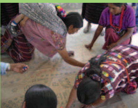
People's participation within planning processes: Women are mapping their community in Guatemala